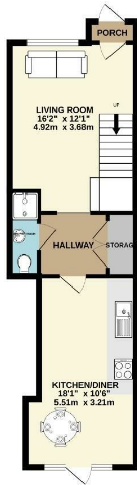
GROUND FLOOR 451 sq.ft. (41.9 sq.m.) approx.